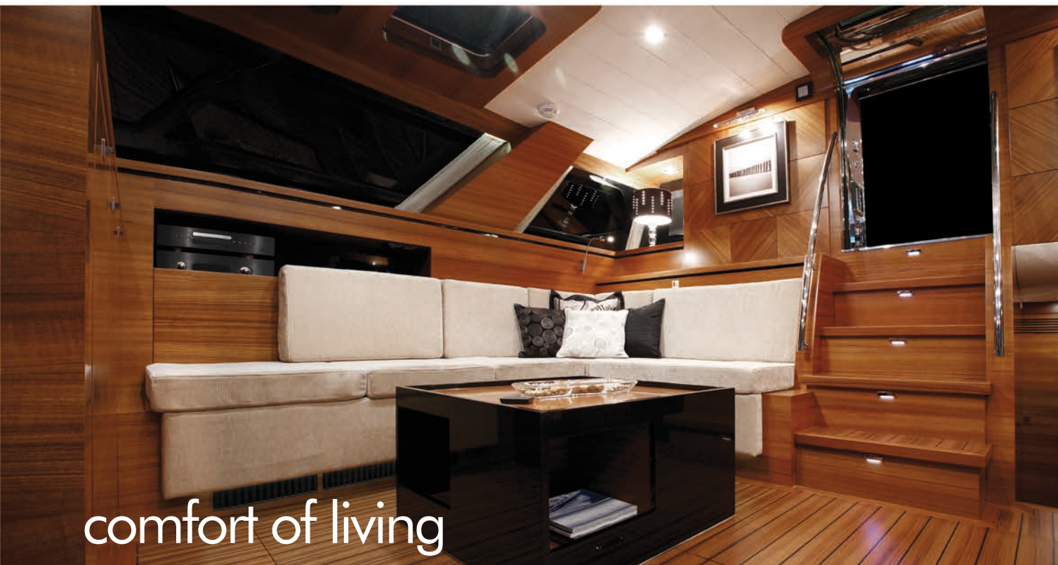
comfort of living