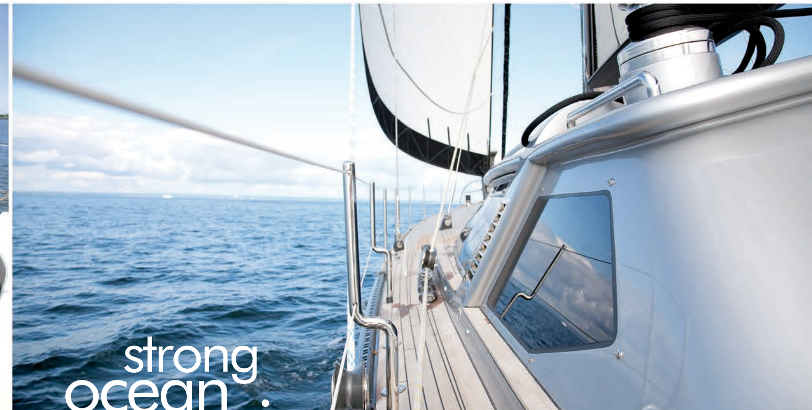
strong ocean. cruiser