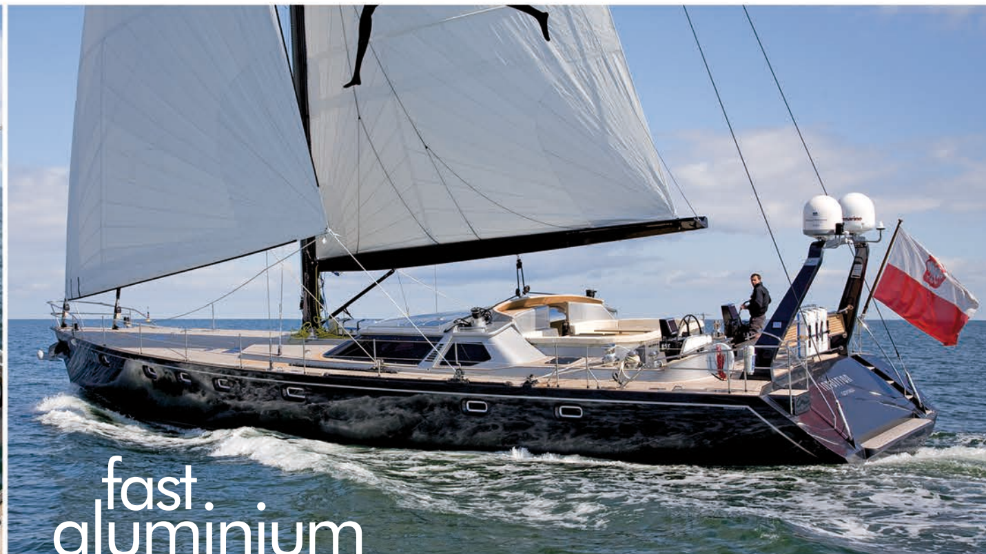
fast. aluminium yacht